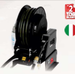
212000 PIUSI 12V DIESEL REFUELLING SYSTEM