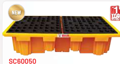
SC60050 EL SERIES DOUBLE IBC SPILL CONTAINER