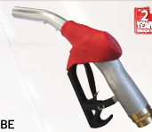
51040 ALEMLUBE 1" HIGH FLOW AUTO SHUT OFF DIESEL NOZZLE