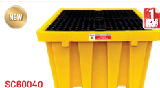
SC60040 EL SERIES SINGLE IBC SPILL CONTAINER

Also available: SC60050WC Double IBC Protection Cover $660.00