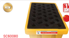
SC60080 EL SERIES 2 DRUM SPILL CONTAINER

Also available: SC60040WC Single IBC Protection Cover $440.00