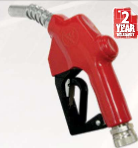
51039 ALEMLUBE AUTO SHUT OFF DIESEL NOZZLE