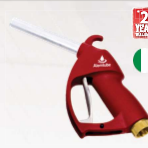
52007 ALEMLUBE MANUAL SHUT-OFF DIESEL NOZZLE