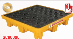
SC60090 EL SERIES 4 DRUM SPILL CONTAINER