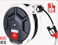
HR90080C EL SERIES 3/4" DIESEL FUEL HOSE REEL WITH AUTO SHUT OFF NOZZLE