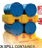
SJ-200-010 EL SERIES 4 DRUM RACK SPILL CONTAINER